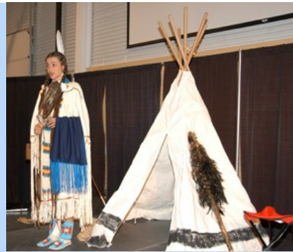
Wyoming History Day student.

Each year, more than half a million students, encouraged by thousands of teachers nationwide, participate in the NHD contest.