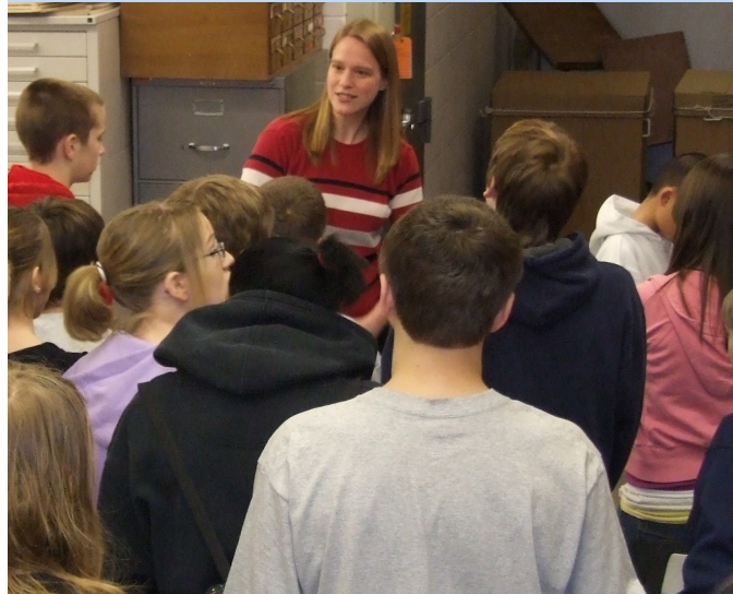
National History Day students at Iowa State University.